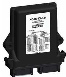
EXPANDABLE I/O OPTIONS